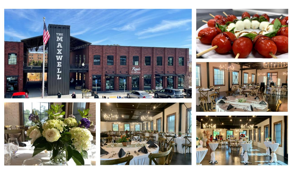
240 South Main Street • Alpharetta • 30009